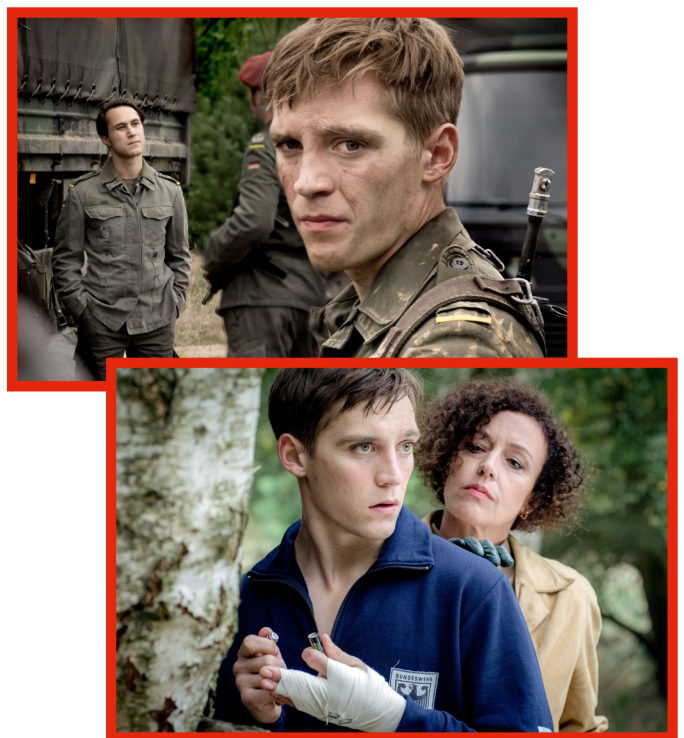
The New York Times calls Deutschland 83 "fresh and enjoyable"

On 17 June, Deutschland 83 a series commissioned by RTL Television, produced by UFA Fiction and distributed by FremantleMedia International, made its US debut on AMC's Sundance Channel – even before its broadcast on RTL Television in Germany in autumn 2015. FremantleMedia International has sold the rights to the series to Canal Plus in France. SVT (Sweden), NRK (Norway), DR (Denmark), YLE (Finland) and RUV (Iceland) have also acquired broadcasting rights to the series. Not only did it score excellent audience ratings, viewers and critics praise the series alike.