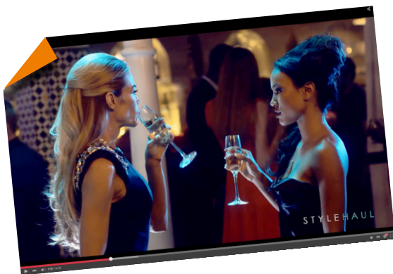
Vanity is StyleHaul's first original scripted series and launched in June

In June 2015, RTL Group announced the creation of RTL Digital Hub, a new unit that bundles the company's recent investments in the online video segment, in particular BroadbandTV, StyleHaul and SpotXchange. The new structure promotes the multi-channel networks and growth in the complementary portfolio. Under the decentralised organisational structure of RTL Group, the CEOs of BroadbandTV, StyleHaul and SpotXchange continue to bear full responsibility for their respective companies. RTL Digital Hub also supports external partnerships and synergies with the RTL Group channels, the global production arm FremantleMedia, and other Bertelsmann divisions. In addition, RTL Digital Hub reviews the market intensively for further investment opportunities in the online video business.