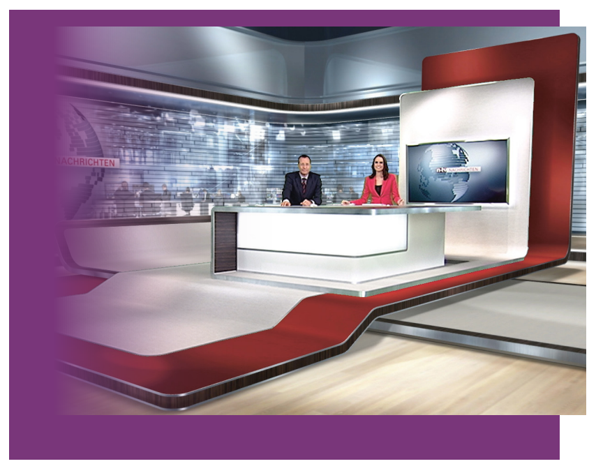
N-TV broadcasts comprehensive reports from its studio

The most stirring moment in interviews with prospective trainees always comes when they realise that they too can make a difference. They don't have to perform any heroics or put their lives on the line, but they must be tenacious, sceptical and courageous. Because freedom comes with an integral responsibility to put it to good use, in the interests of, and on behalf of, our viewers, readers and users.